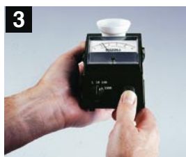
3 Push button to indicate reading