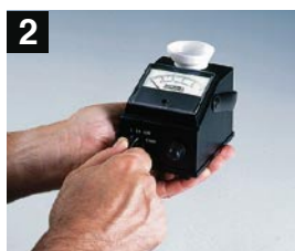
2 Select Cond/TDS range