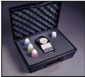
Porta-Kit with EP11/PH

All Myron L instruments are factory calibrated with Standard Solutions of known conductivity/TDS value and (when appropriate) with pH buffer values 4, 7 and 10. These solutions and buffers are traceable to the U.S. Government's National Institute of Standards