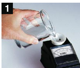
1 Rinse and fill cell cup